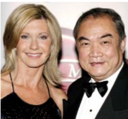
Olivia with Melbourne Lord Mayor, John So

T he support we receive for our Appeal continues to inspire others to join the mission towards helping change the way cancer is treated. In September 2008, Olivia Newton-John attended two special events in Melbourne to announce $2.5 million worth of new support.