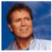
Sir Cliff Richard

You too can help the Appeal by making a donation today to the Olivia Newton-John Cancer and Wellness Centre Appeal. Your support is greatly appreciated.