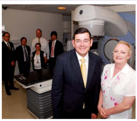
Victorian Health Minister Daniel Andrews in front of one of the Elekta Synergy linear accelerators with members of Austin's Cancer and Radiotherapy Services.

Austin Health has boosted current cancer treatment services with new radiotherapy technology. Two Elekta Synergy linear accelerators have been installed and are the first of their type in Australia.